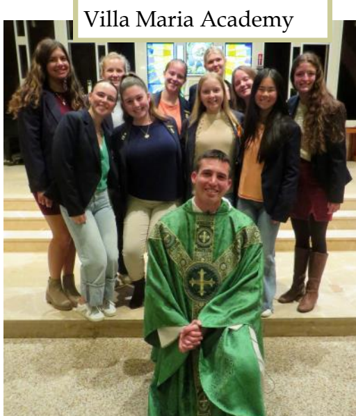
Villa Maria Academy