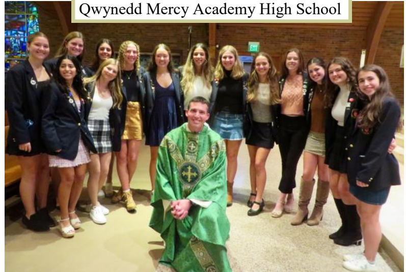
Qwynedd Mercy Academy High School