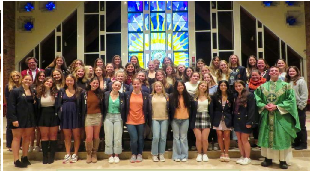
A Blessing from Father for their Sunday best.